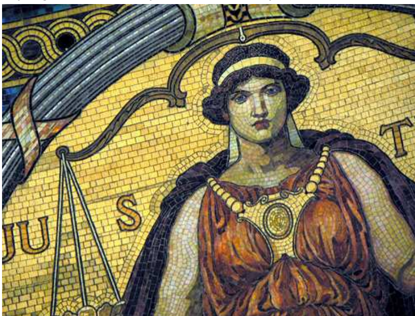
Wisconsin State Capitol Rotunda Mosaic: Lady Justice

“The Church has rejected the totalitarian and atheistic ideologies associated in modern times with “communism” or “socialism.” She has likewise refused to accept, in the practice of “capitalism,” individualism and the absolute primacy of the law of the marketplace over human labor. “Regulating the economy solely by centralized planning perverts the basis of social bonds; regulating it solely by the law of the marketplace fails social justice, for there are many human needs which cannot be satisfied by the market.” Reasonable regulation of the marketplace and economic initiatives, in keeping with a just hierarchy of values and a view to the common good, is to be commended.” [CCC # 2425]