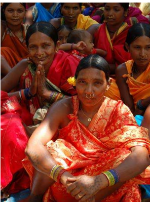
Members of a micro-finance program in Bai-pariguda, India.

Since 1988 Catholic Relief Services' microfinance program has been reaching the worlds poorest communities with access to financial services that are sustainable over