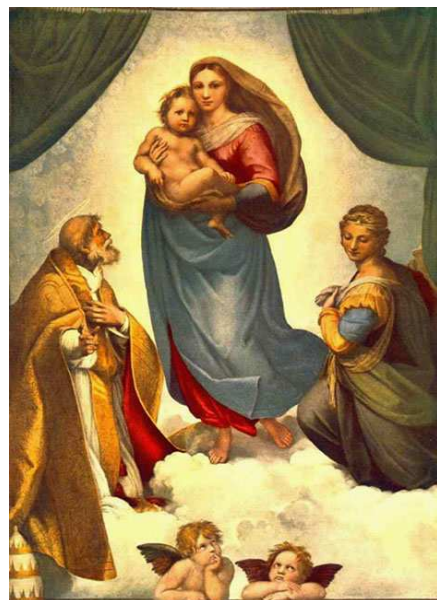
Sistine Madonna by Raphael Raffaello