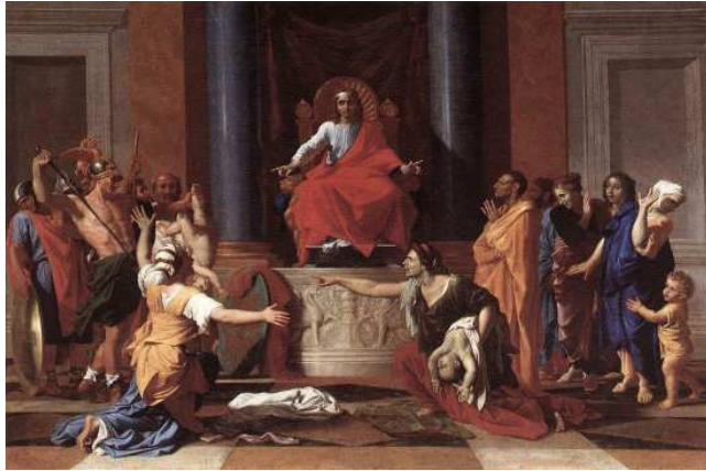
The Judgment of Solomon by Nicolas Poussin

Law is a rule of conduct enacted by a competent authority for the purpose of governing human activity for the sake of the common good. Jurisprudence is the theory, philosophy and practice of law. It addresses the tension between human freedom and the social order.