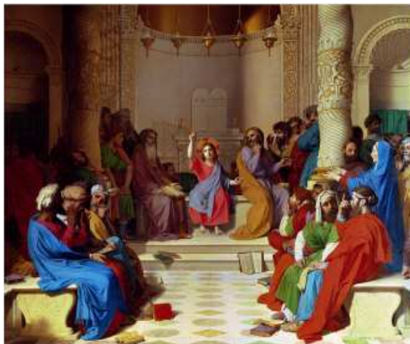
Jesus Among the Doctors by Jean Auguste Dominique Ingres

The physical laws establish an order to creation. All physical matter is subject to their “judgment” and constraint. As there are laws regarding physical matter, there are also established laws regarding human activities. Such laws do exist and they include natural law. They too have judgments and constraints on human societies. The human person can recognize these and study them by using his free will and intellect which are gifts given by God that make man “in the image of God”. These are intelligible laws and wise is the person who recognizes and comprehends them.