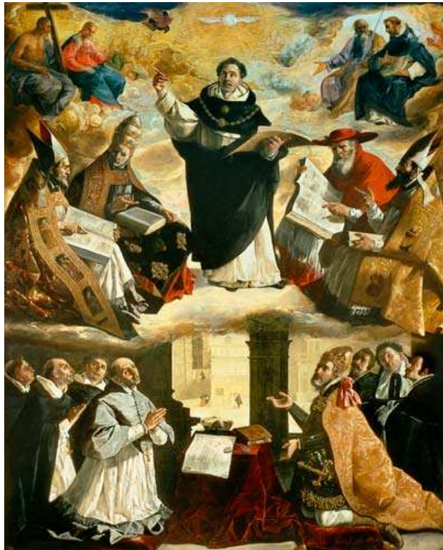
The Apotheosis of St. Thomas Aquinas by Francisco de Zurbarán

“...this is the first precept of the law that good is to be done and promoted, and evil is to be avoided. All other precepts of the natural law are based on this...”