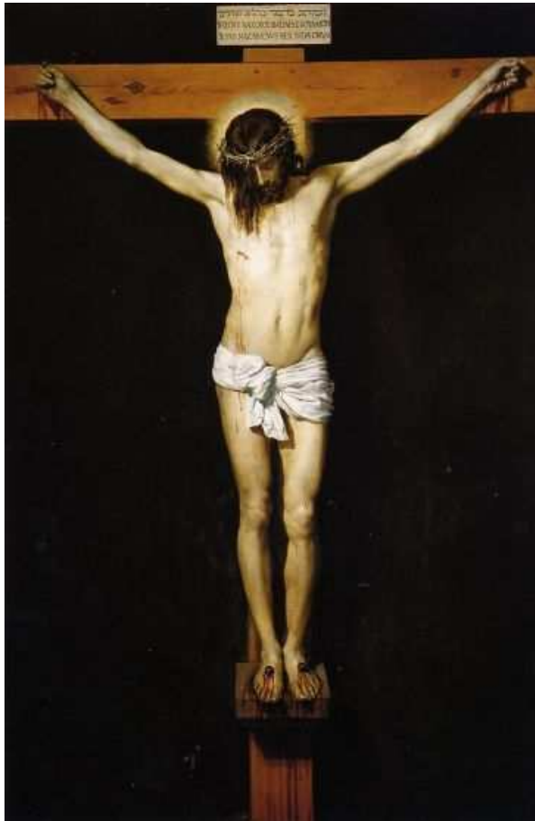
Christ Crucified by Diego Velazquez

Be exalted, O God, above the heavens; Let your glory be above all the earth. – Psalm 57:5