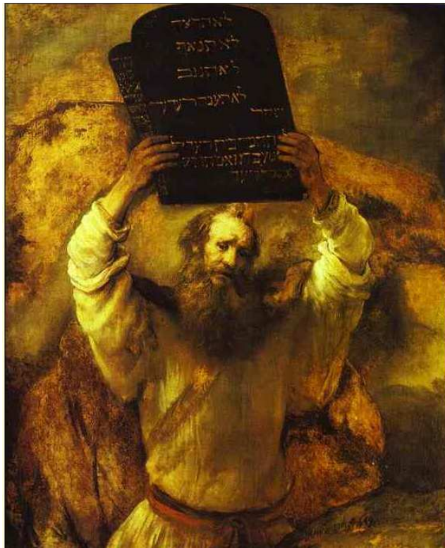
Moses Smashing the Tables of the Law by Rembrandt

The natural law is nothing other than the light of understanding placed in us by God; through it we know what we must do and what we must avoid. God has given this light or law at creation. – St. Thomas Aquinas