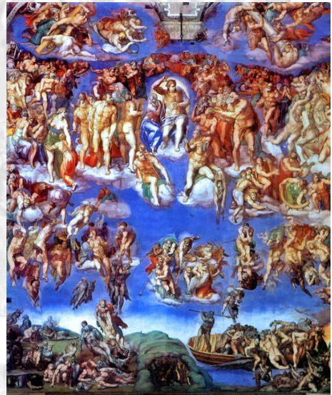
The Last Judgment by Michelangelo