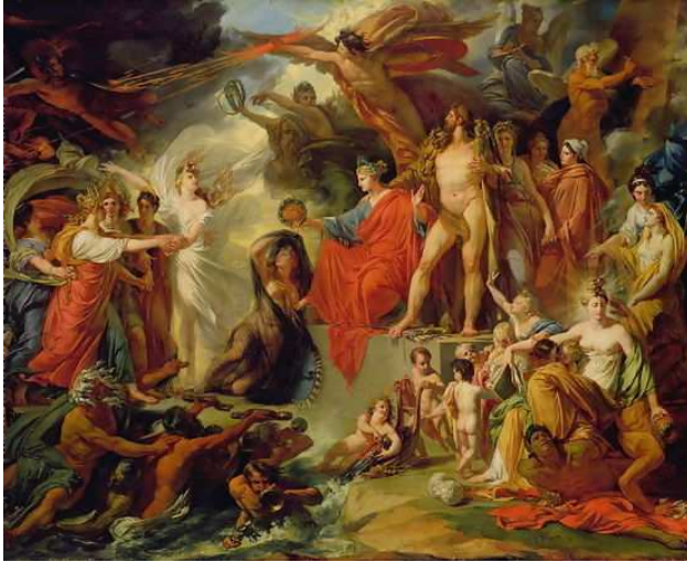
The Triumph of Civilization by Jacques Réattu

If not for the natural law and man made laws, unruliness would be inevitable and human endeavors would fail. Yet, even with these laws fully recognized, the effect of original sin disposes man to acts of injustice and grievance. Although in a fallen state, man is not an absolute instinctual creature devoid of freedom and principles. Man