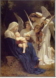
Song of the Angels, Bouguereau

"Father from the beginning of time you have always done what is good for man..." - Eucharist Prayer for Reconciliation I