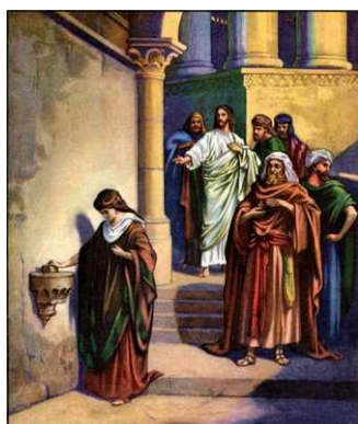
The Widow's Mite by Gustave Dore Mark 12:41-44

Faith Finances is about applying God's word to personal finances and mastering the three principles to biblical finances: Giving, Managing, and Increase