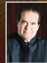
ANTONIN SCALIA Associate Justice of the United States Supreme Court