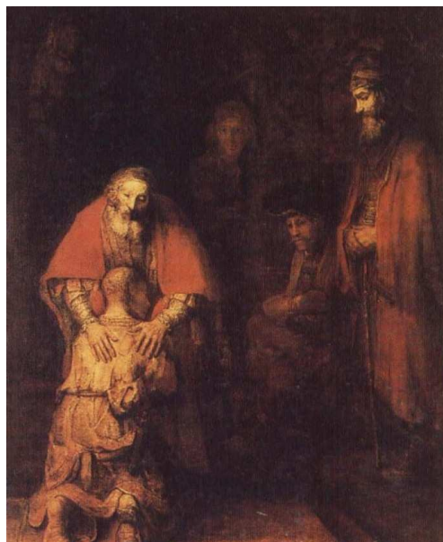
The Return of the Prodigal Son, Rembrandt

“while he was still a long way off.” You probably know someone who’s been away from the Church and is still “a long way off” spiritually. No matter. The fact that they’ve decided to ‘come home’ is cause for great joy.