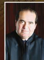
ANTONIN SCALIA Associate Justice of the United States Supreme Court