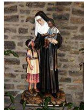
St. Katharine Drexel Feast Day March 3 Canonized - October 2000