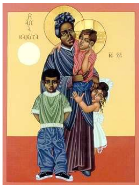
St. Josephine Bakhita Feast Day February 8 Canonized - October 2000